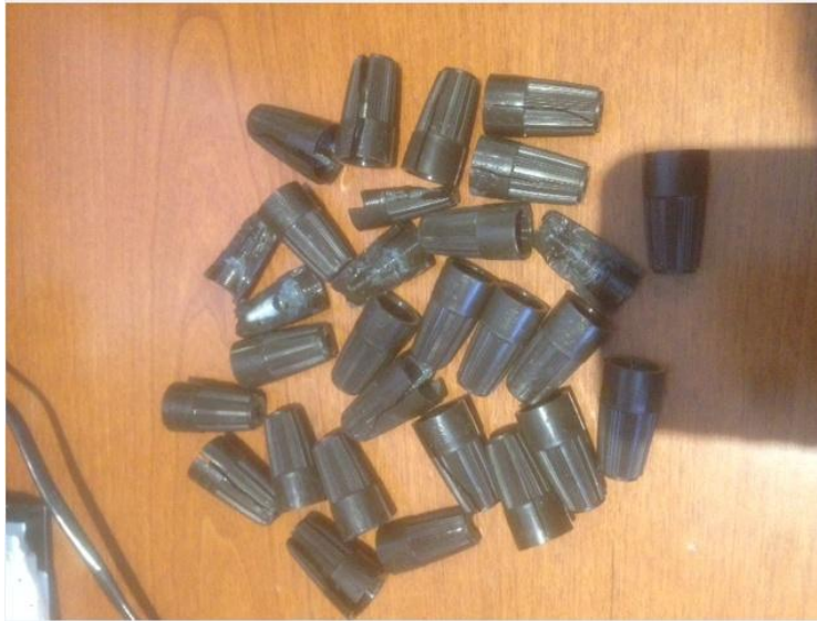
Figure F2 – Non-Petroleum based inhibitor failures